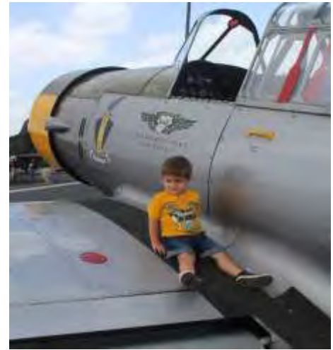
Checking out the plane

These barnstorming events are beneficial to the Wing for many reasons. They provide us a chance to work with other Wings within the CAF, our members get to meet members at other units possibly developing new friendships, we (should) generate some revenue for the Wing and lastly....we work hard, but have a LOT of fun!!!!