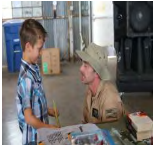
Cotter talking to a future Pilot