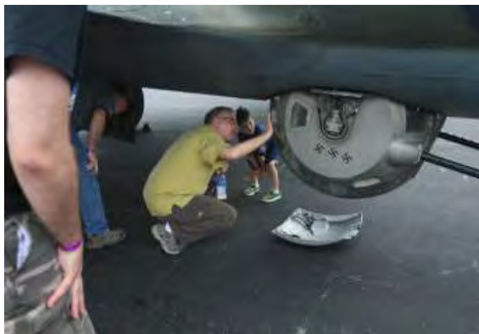
Around the Hangar – this is a priceless photo

I would like to thank all our photographers that work so hard quietly, passionately and with great dedication making sure that all our events are recorded for ever in time. Most of these folks have many other duties but since photography is their passion, they always seem to find time to pick up their camera and capture those moments for all of us to enjoy.