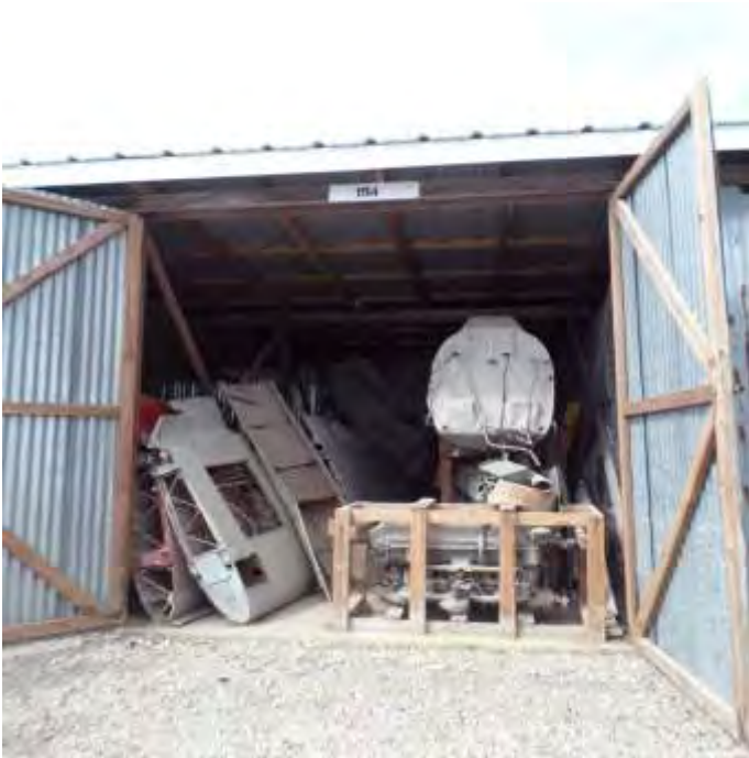
PT-19 parts including wings, center sections, Fuselages, tail feathers and a crated up engine