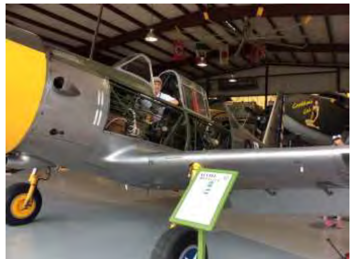
Station #4: Chuck Waters at the AT-6 letting kids get into the aircraft's cockpit.