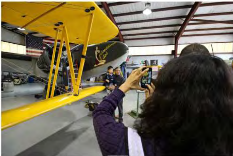
Family's Photo OP with our ever popular "Goodtime Gal"