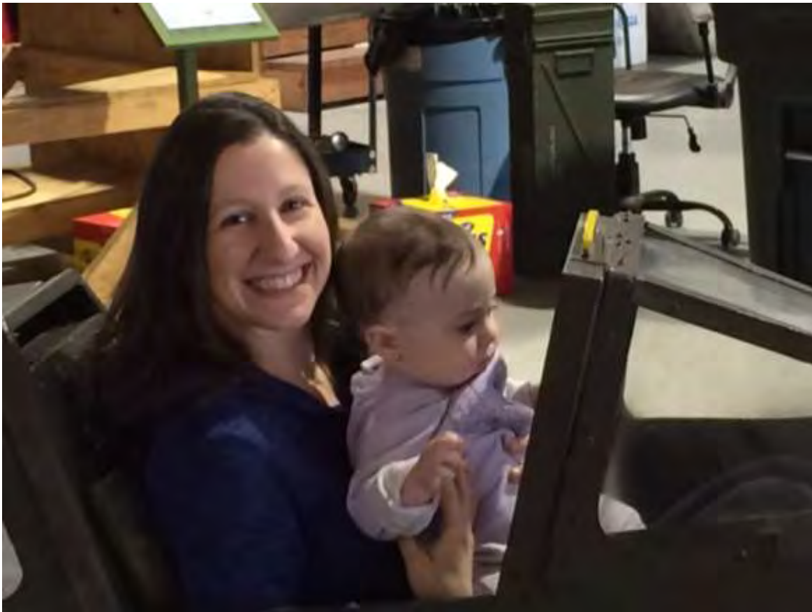
Mother and one of our youngest future pilots sitting in Thunderduck.