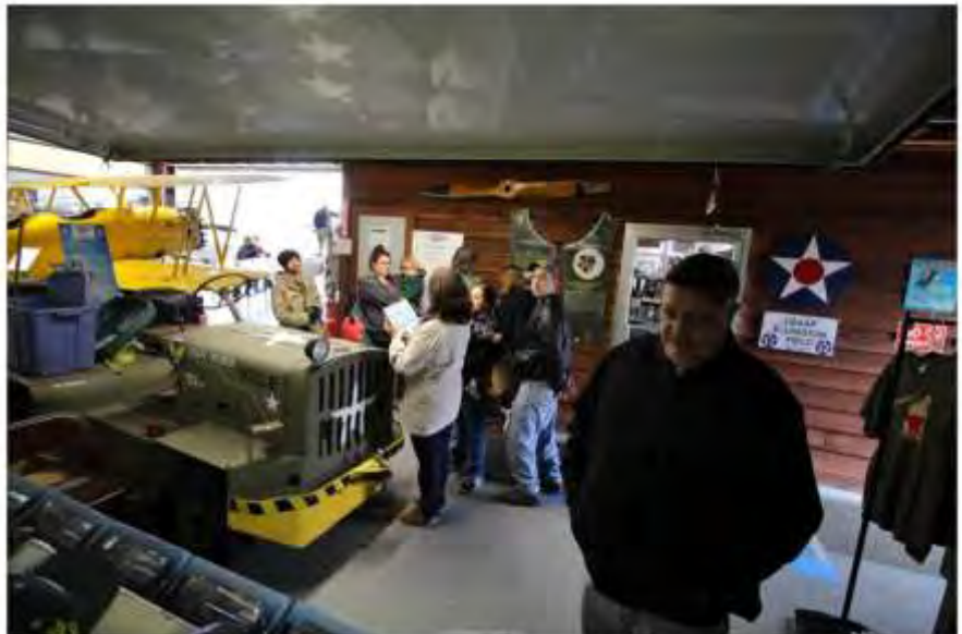
Visitors learning about Aircraft Recognition