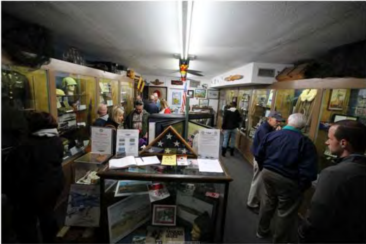
Visitors to our Museum